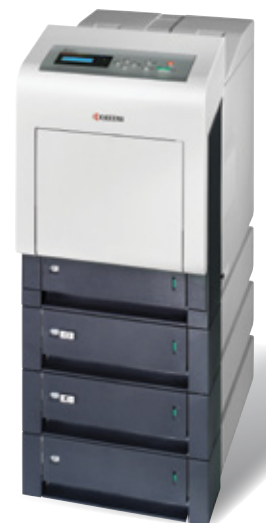
Product depicted includes optional extras.

Windows Vista and the Windows Vista logo are trademarks or registered trademarks of Microsoft Corporation in the United States and/or other countries.