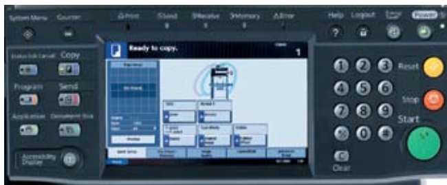
8.5 inch colour touch panel with on-screen guidance.

With the potential to do so much at once, you might think it's easy to lose track of what you're doing. That's unlikely with a colour touch panel this large. To increase usability, the buttons and icons that people use most often are given priority. Related menu options are intuitively shown on the same screen. And it's easy to retrieve files stored in the 80 GB document box, without opening files, by simply viewing colour thumbnails and previews.