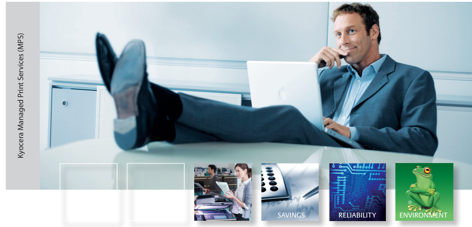
Kyocera Managed Print Services (MPS)

REDUCE 'WHOLE OF LIFE' COSTS INCREASE PRODUCTIVITY AND USER SATISFACTION IMPROVE ENVIRONMENTAL SUSTAINABILITY IMPROVE BUSINESS EFFICIENCIES